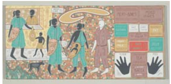
Part Two of "Ration Day times"